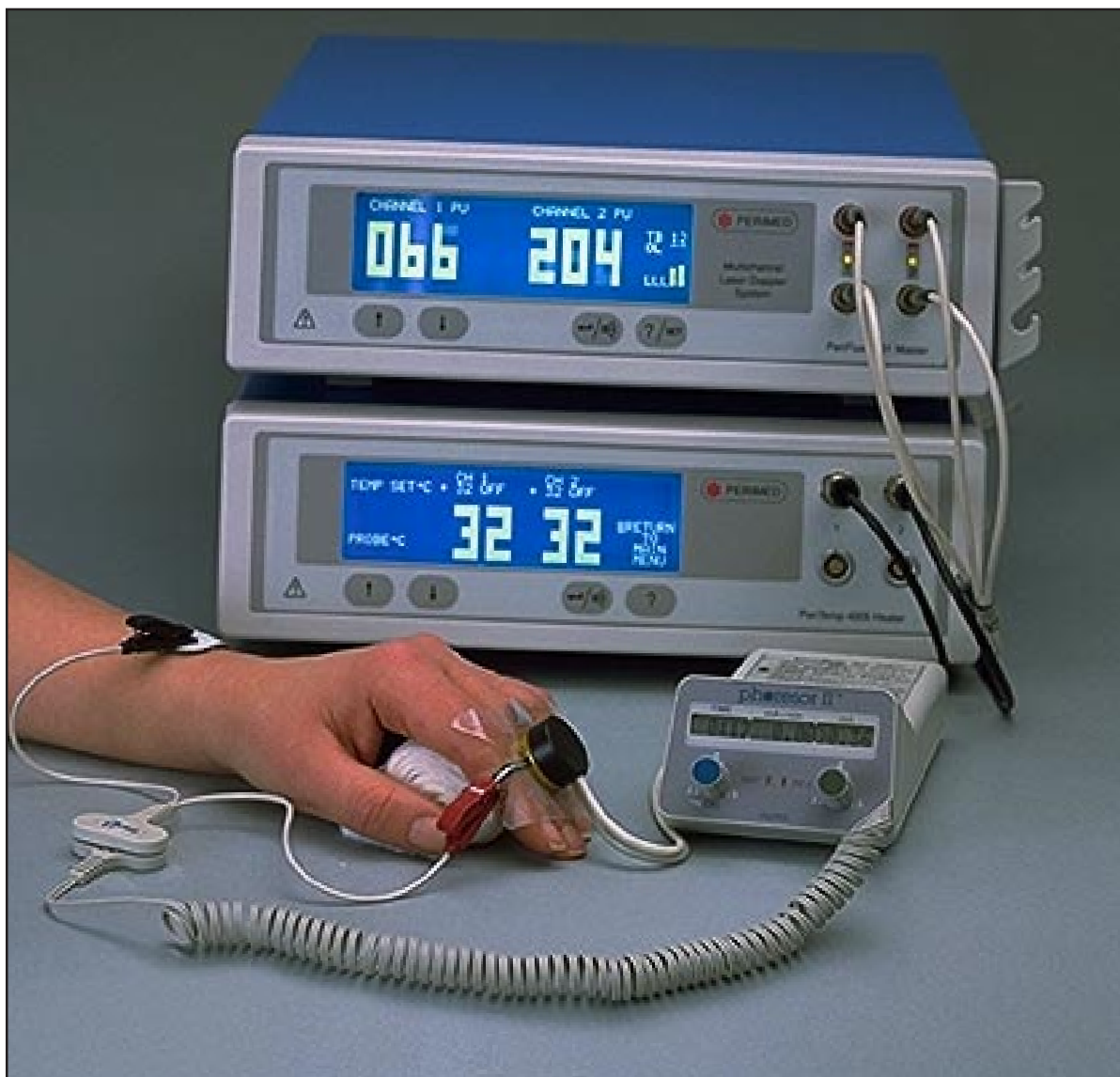
PF480 Perilont Micropharmacology System combined with laser Doppler, PF 4001-2 Periflux Master and PF 4005-2 PeriTemp Tissue Heater.

Using Iontophoresis, minute volumes of drugs can be non-invasively administered in a controlled fashion. The vascular responses are measured by laser Doppler.